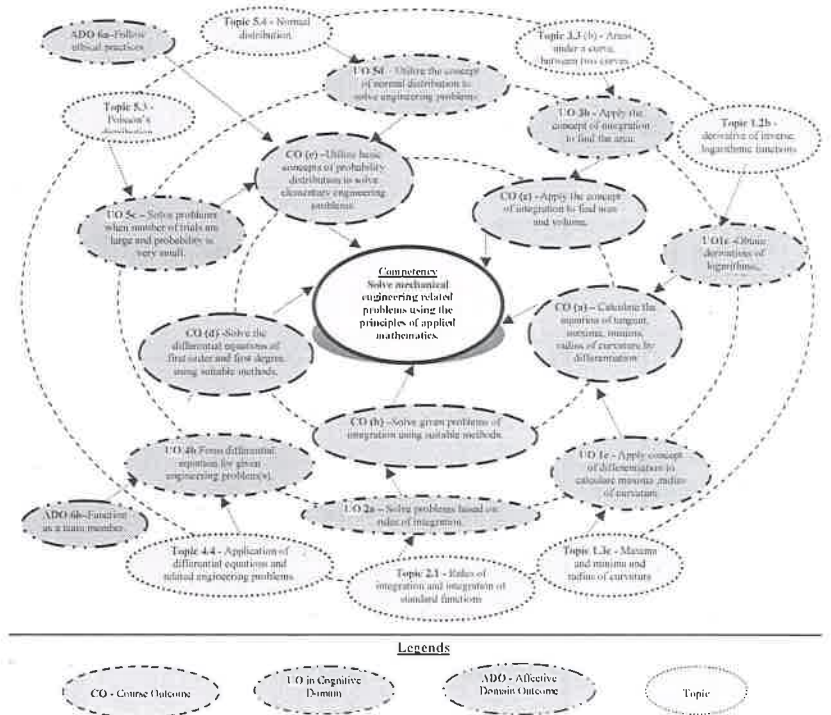
Figure 1 - Course Map

This course map illustrates an overview of the flow and linkages of the topics at various levels of outcomes (details in subsequent sections) to be attained by the student by the end of the course, in all domains of learning in terms of the industry/employer identified competency depicted at the centre of this map.